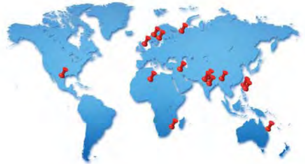
Figure 2: World map with users location

chances are that 3 of those friends are vulnerable to our exploit. Figure 2 shows the declared locations of the 15 users who accounts we compromised on a world map, using drawing pins. Remarkably, just with a small set of 15 compromised accounts an attack was able to reach world scale.